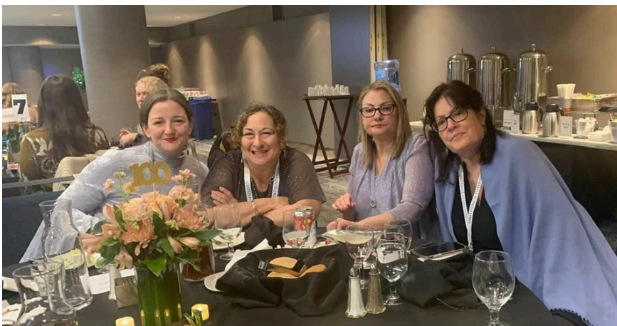
PHN Nursing Section Luncheon, celebrating its 100th Anniversary!