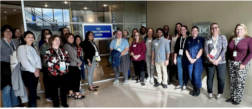
Visit to CDC's Emergency Operations Center!

One of the Benefits of being a member of MAPHN is the availability of scholarship support to attend professional events such as the annual American Public Health Association (APHA) and Association of Public Health Nurses (APHN) conferences. Interested in attending in 2024? Contact your Chapter President or Admin@maphn.org for more information.