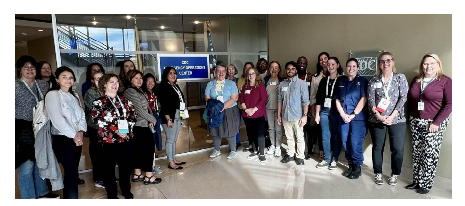
Visit to CDC's Emergency Operations Center!

One of the Benefits of being a member of MAPHN is the availability of scholarship support to attend professional events such as the annual American Public Health Association (APHA) and Association of Public Health Nurses (APHN) conferences. Interested in attending in 2024? Contact your Chapter President or <a href="Mathematical Admin@maphn.org">Admin@maphn.org</a> for more information.